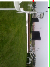
1 RIVIERA TRIBUNE