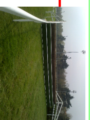
6 ANGELO SABARATO CON TERNA