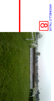
8 ANGELO TALUS