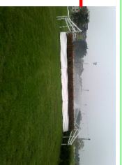
3 STEEP MILANO