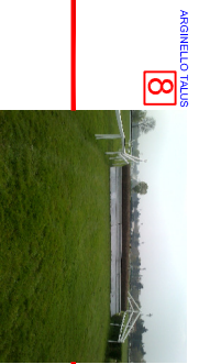
8 ARGINELLO TALUS