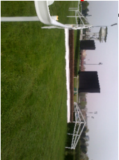
1 RIVIERA TRIBUNE