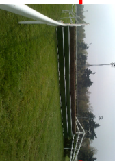
6 ARGINELLO SBARRATO CON TERRA